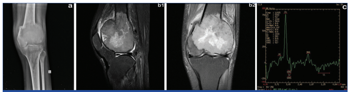
[Table/Fig-2]: (a) radiograph of knee showing expansile lytic lesion in the lower end of the femur in the subarticular location with narrow zone of transition associated with cortical breech. (b1) MR Proton Density Fat Suppressed (PDFS) sagittal image shows peripheral intermediate and central hyperintense signal intensity lesion in the lower end of the femur. (b2) MR T2 weighted coronal image shows intermediate to hyperintense lesion with cortical breech. (c) Proton MRS shows choline peak at 3.2ppm with lactate peak